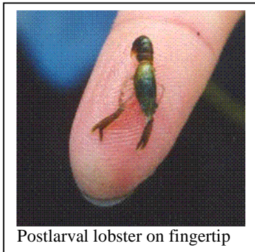
Postlarval lobster on fingertip