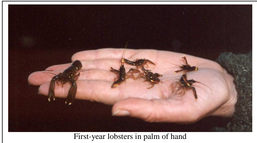
First-year lobsters in palm of hand

Summary table of lobsters found in Jun-Aug 2009 for each site where sampling was possible and data were entered. Locations are listed from Northeast to Southwest. Sites where settlement occurred are bold faced. Sites where lobsters less than one year old were found are italicized.